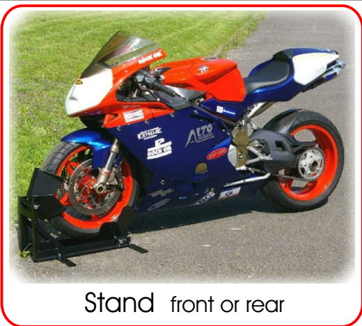
Stand front or rear